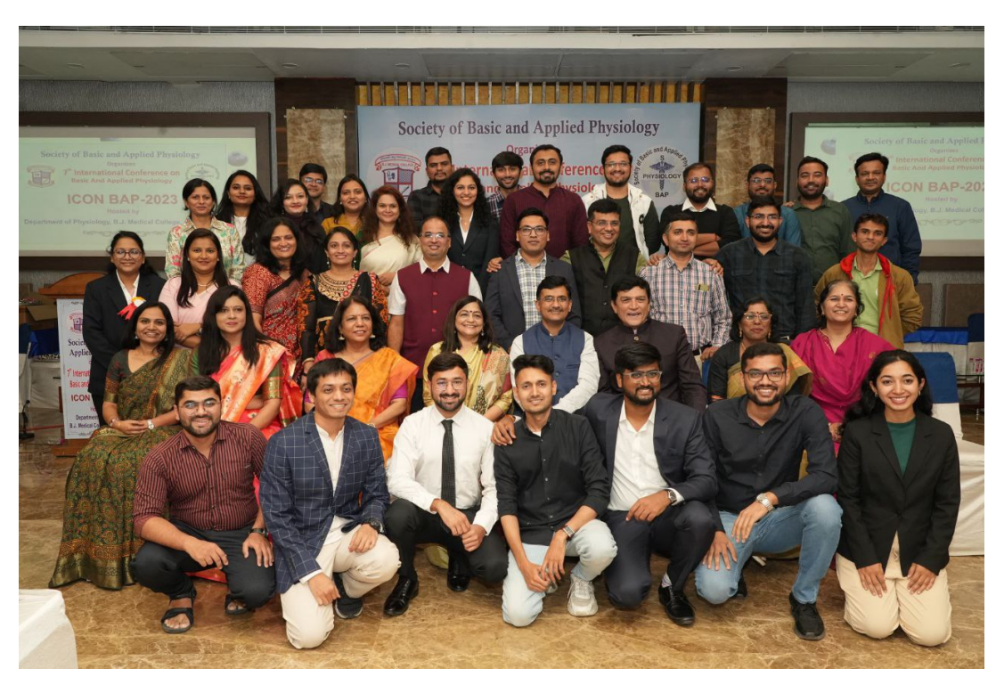
Department of Physiology of B.J. Medical College, Ahmedabad